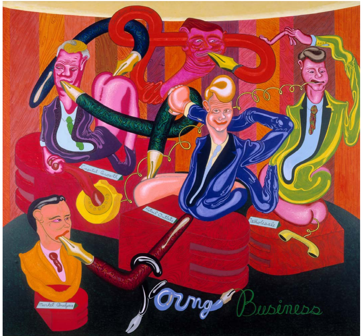
4 Peter Saul Young Business Oil and acrylic on canvas 171 x 182 cm. 67.3 x 71.7 in. Executed in 1969