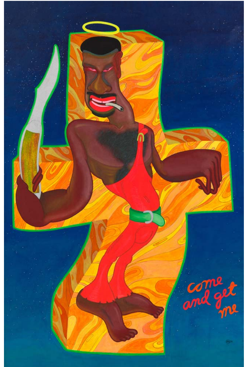
2 Peter Saul Come and get me Oil on canvas 161.3 x 106.7 cm. 63.5 x 42 in. Executed in 1968