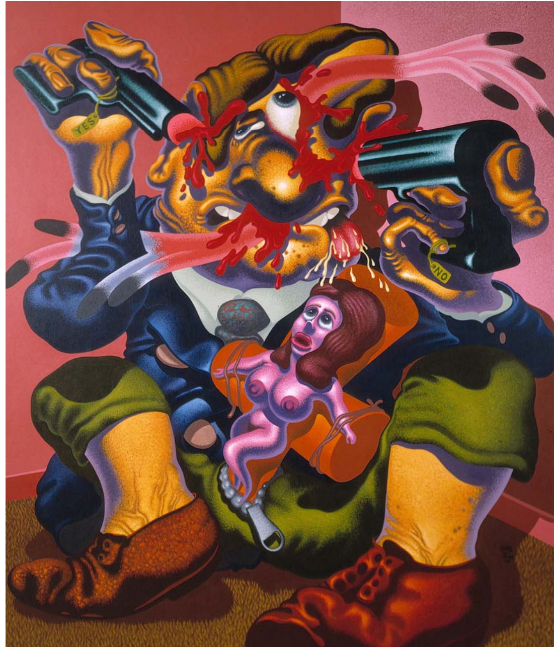
7 Peter Saul Girl Trouble I Oil and acrylic on canvas 213.4 x 182.9 cm. 84 x 72 in. Executed in 1984-1986