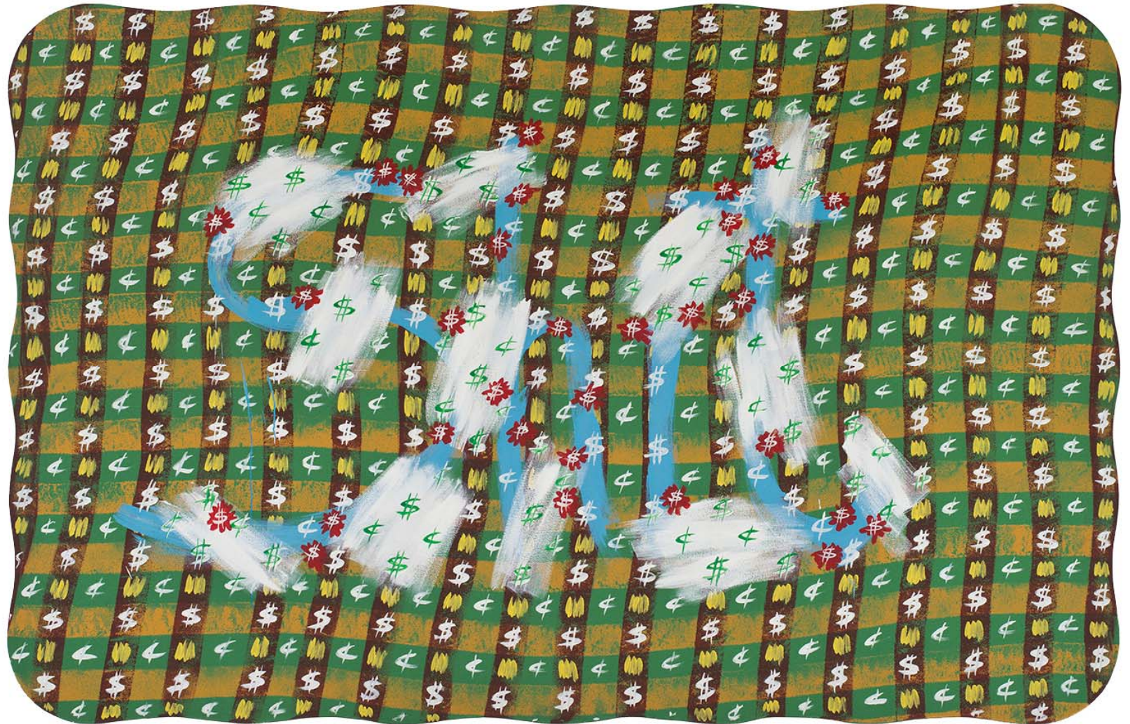
12 John Tweddle Savings Account Acrylic on canvas 198 x 305 cm. 78 x 120.1 in. Executed in 1971