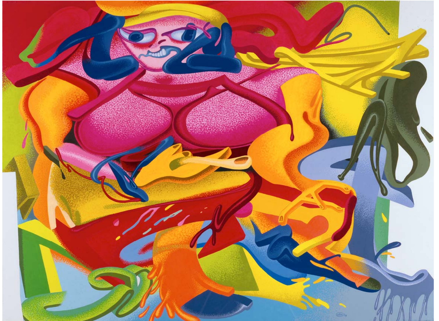
6 Peter Saul De Kooning's Woman I Acrylic on board 76 x 101 cm. 29.9 x 39.8 in. Executed in 1978