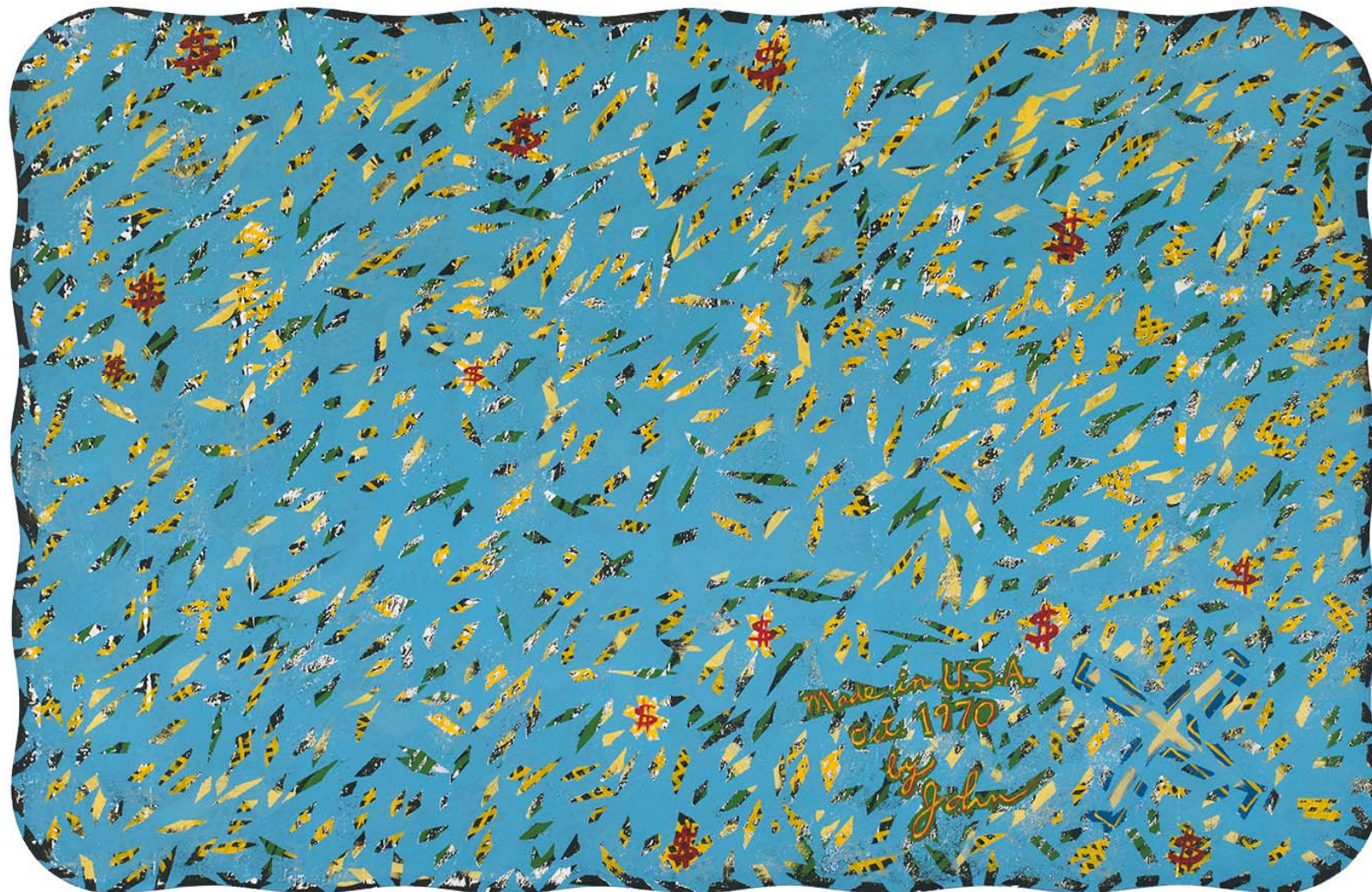
9 John Tweddle Tape Job Acrylic on canvas 199 x 305 cm. 78.3 x 120.1 in. Executed in October 1970