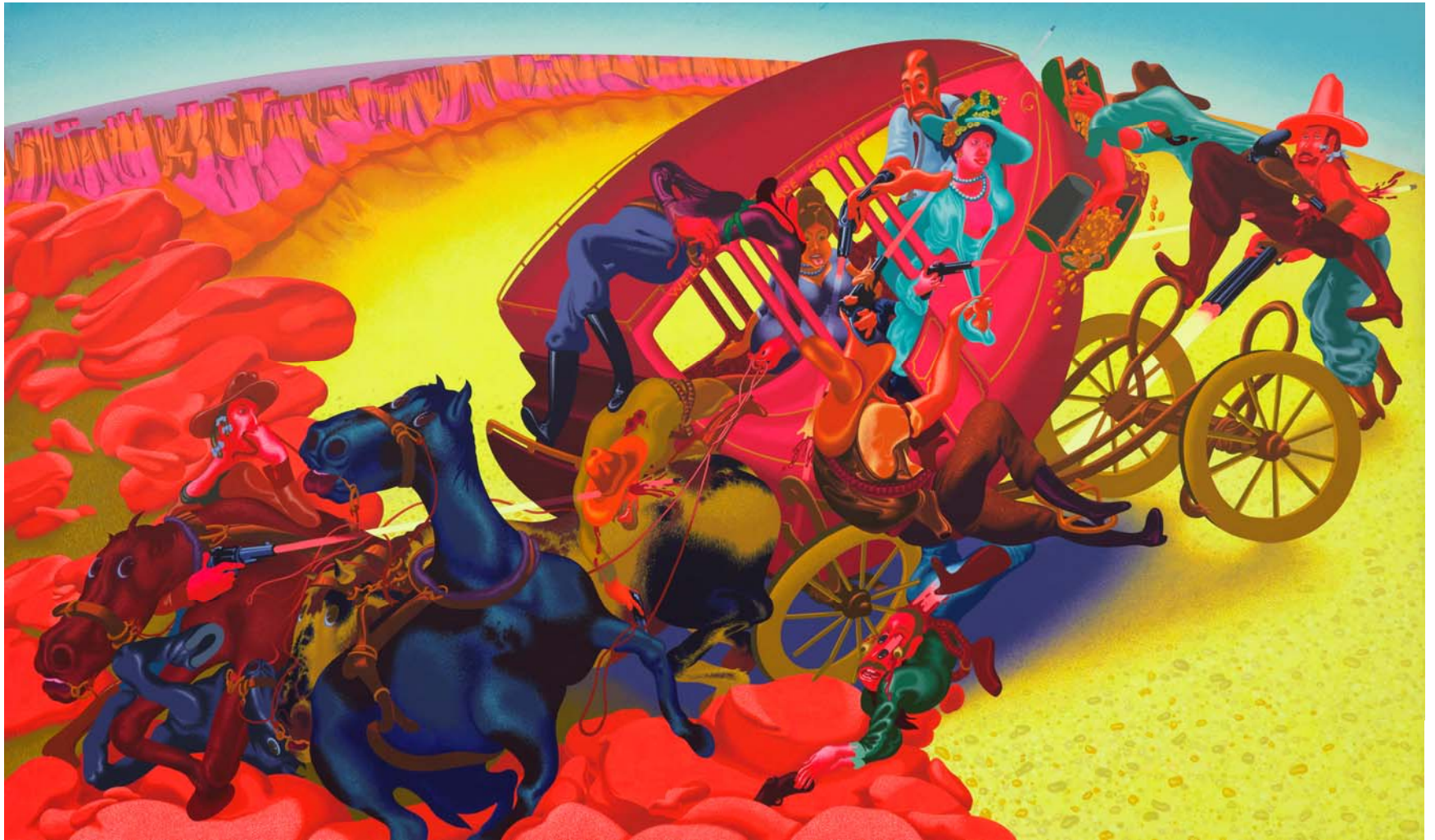
5 Peter Saul Stagecoach Acrylic on canvas 218.4 x 365.8 cm. 86 x 144 in. Executed in 1977