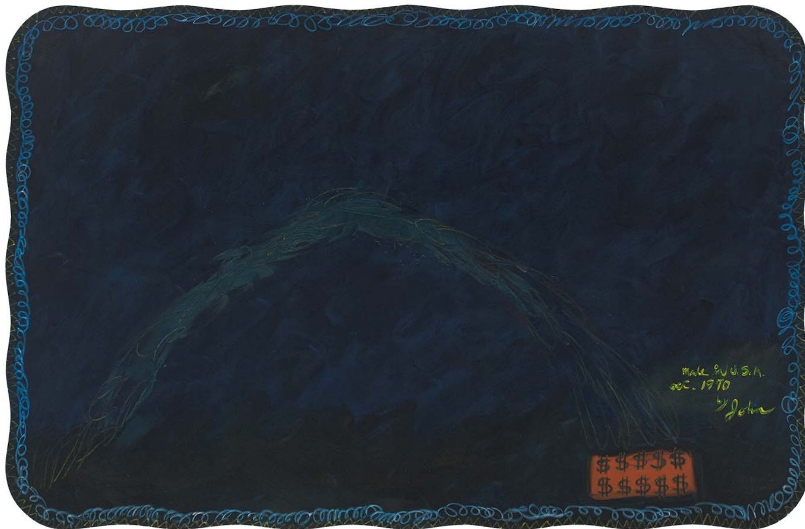
8 John Tweddle Deep Space Oil on canvas 199 x 305 cm. 78.3 x 120.1 in. Executed in October 1970